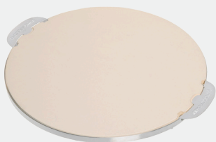
PIZZA STONE 570