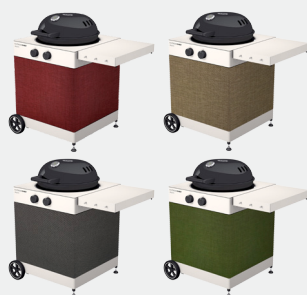
AROSA TEXTILE COVER