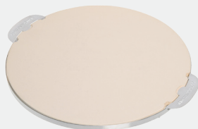
PIZZA STONE 480